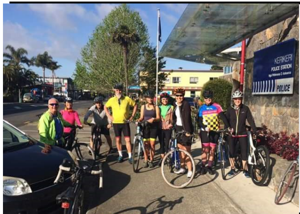
Easy Riders before the 'off'